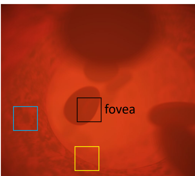
(a) original light field