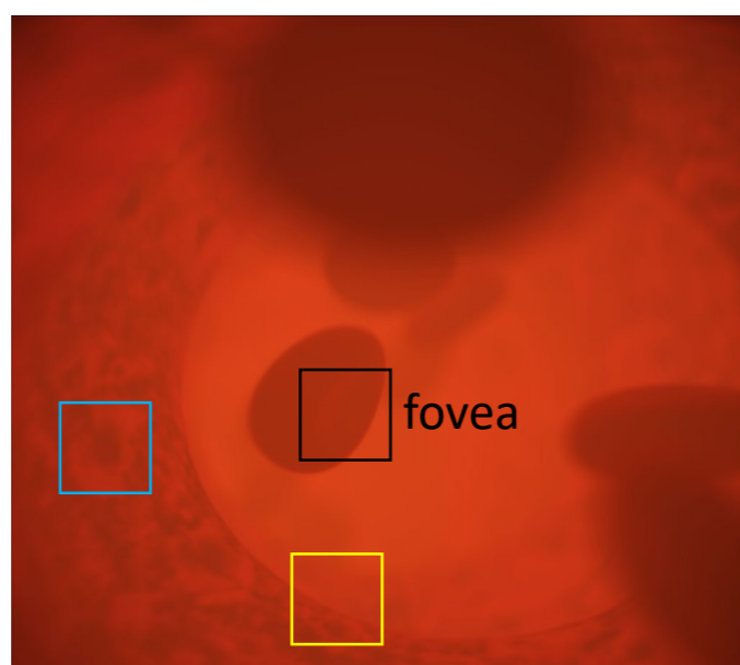
(b) 3D-KFR, \sigma = 1.6