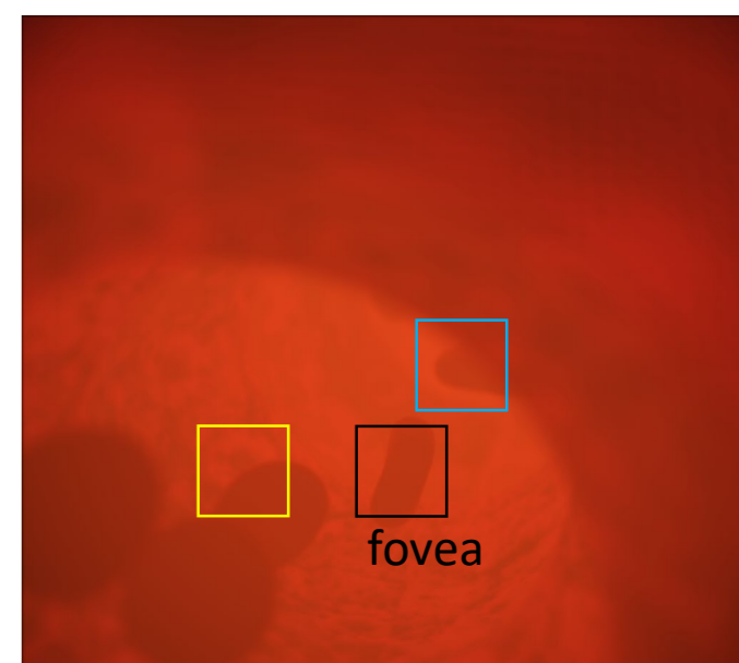
(d) 3D-KFR, \sigma = 2.6